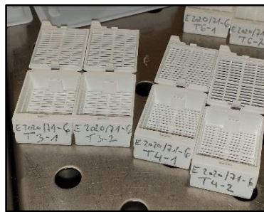
Fig. 4. Correct labeling of the histology cassette front side using a pencil .