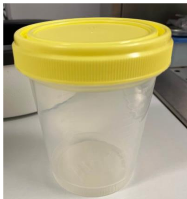
Fig. 5. Appropriate container.