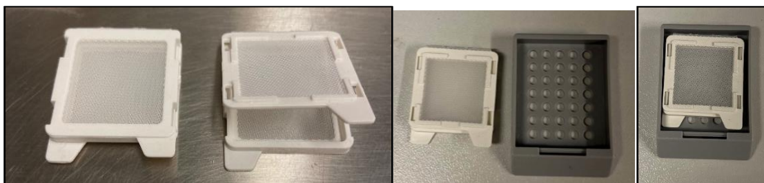
Fig. 1. Histology cassette inlets for small specimens (e.g., biopsies, Inn). This inlet must then be placed into a regular histology cassette (see below).